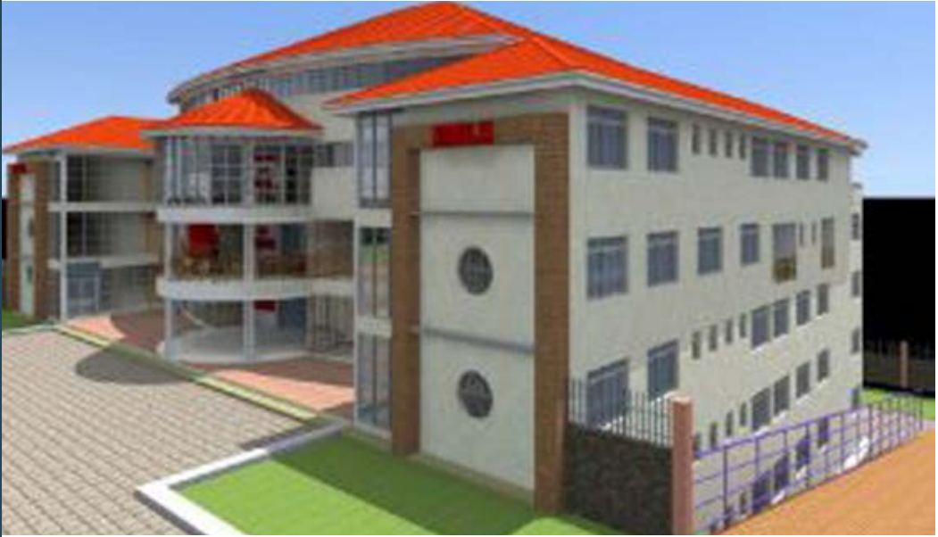
Artistic Impression of the New IMLS main Building