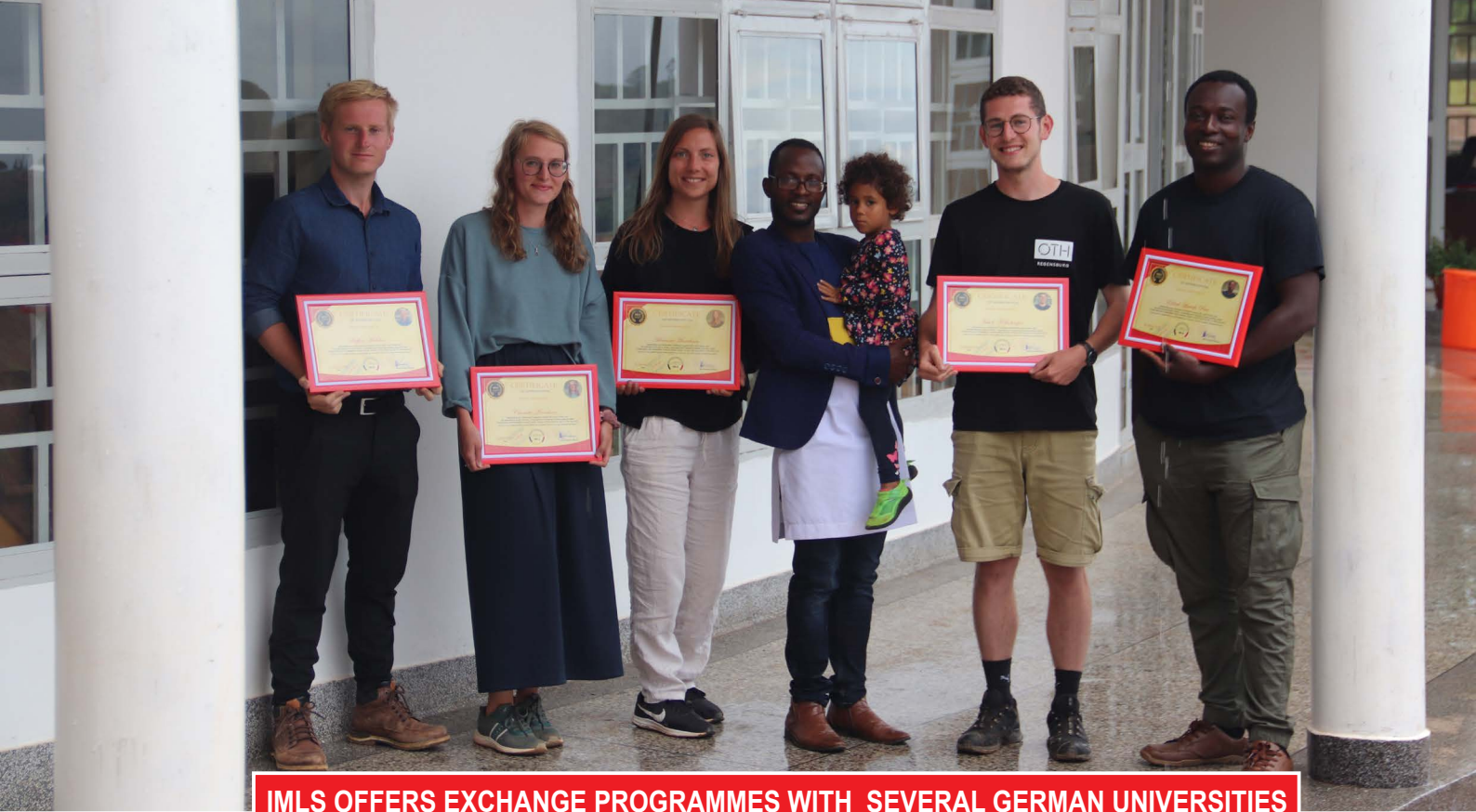
IMLS OFFERS EXCHANGE PROGRAMMES WITH SEVERAL GERMAN UNIVERSITIES